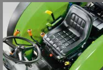
A comfortable driver zone with side controls at your fingertips.

DEUTZ-FAHR AGROPLUS F ECOLINE 310-315-320-405-410-420